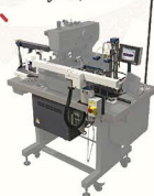
Vinco VC900 Loading & unloading automation for eyelet unit