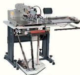
2516V4 DCT Automatic back pocket setter